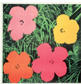
Andy Warhol, "Flowers," 1964. Screenprint printed on white paper. 23" x 23". © 2009 The Andy Warhol Foundation for the Visual Arts/Artists Rights Society (ARS), New York.