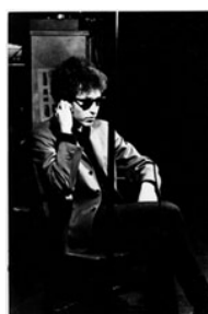
Bob Dylan's screen test.