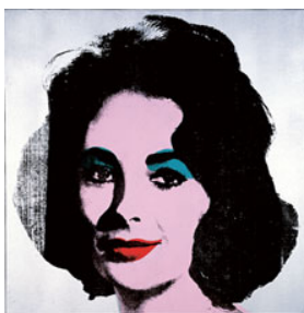
Andy Warhol, Silver Liz , 1963. Synthetic polymer paint and silkscreen ink on canvas, 40" x 40 1/2". Collection of the Andy Warhol Museum, Pittsburgh. © 2009 The Andy Warhol Foundation for the Visual Arts/ARS, New York. Photo credit: The Andy Warhol Foundation, Inc./Art Resource, New York.