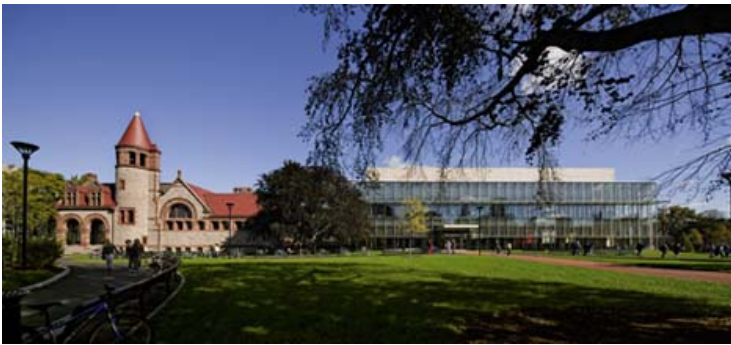
Read a case study on the green renovation of the main branch of the Cambridge Public Library

Featured Excerpts from The Green Studio Handbook